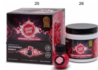
CHERRY BO 2 MB™ BOX/18 | SINGLE SHOOTER | TUB