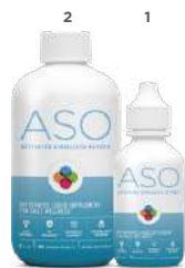
ASO ® STABILIZED OXYGEN