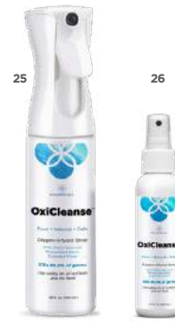
OXICLEANSE™ ANTIBACTERIAL SPRAY